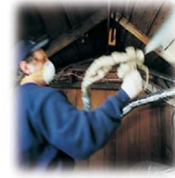
Upgrading insulation and sealing air leakage are frequently recommended to reduce energy costs.

Q. How do I find out if I'm eligible to receive an incentive?