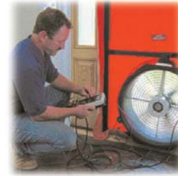
A blower door test is used to measure air leakage and trace air flow.