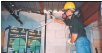
Zerodraft Insulating Air Sealant being applied at roof-wall junction.

Zerodraft Insulating Air Sealant is a polyurethane foam consisting of a mix of chemicals (MDI Monomer and Isobutane/Propane propellant) in a pressurized container and is formulated so that it will react and cure chemically in ambient air.