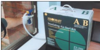
Zerodraft Insulating Air Sealant being applied behind window frame.

In addition to general construction, other industries where Zerodraft Insulating Air Sealant is used include agricultural, boating and marine, cold storage, mining, petrochemical, pools and spas, refrigeration, transportation, and utilities.